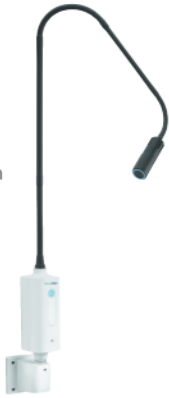
GS Exam Light IV