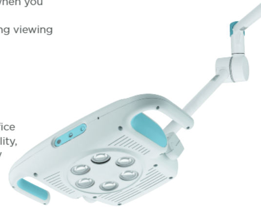
GS 900 Procedure Light